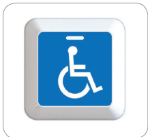
Sticker Option 2