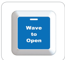
Sticker Option 3