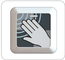
Sticker Option 1