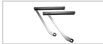
NKGC2 Central saxo arm (Inwards opening)