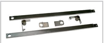
NKGT1 Straight telescopic arm